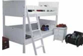
Apple Bunks Single - 1800h x 1005w x 2030L King Single - 1800h x 1160w x 2130L