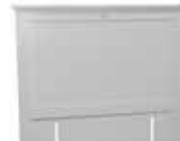
Apple Headboard - 1000h Single, King Single, Double, Queen