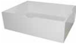
Underbed Box 255h x 800w x 600d