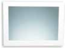
Mirror 600h x 800w