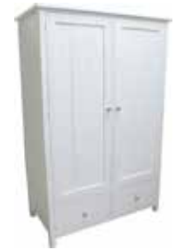
2 Door Wardrobe 1600h x 1050w x 520d