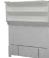
Apple Single Bookshelf Headboard 1500h x 1050W