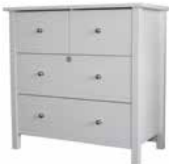
4 Drawer Chest 755h x 800w x 420d