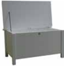
Blanket Box 450h x 850w x 500d