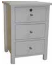
3 Drawer Bedside Cabinet 640h x 450w x 420d