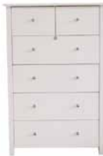
6 Drawer Tallboy 1200h x 800w x 420d