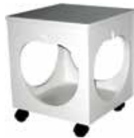
Apple Mobile Stool 465h x 400w x 400d