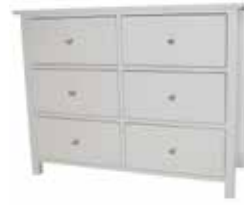
6 Drawer Lowboy 780h x 1000w x 420d