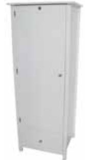
1 Door Wardrobe 1600h x 600w x 520d