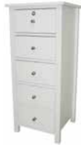
5 Drawer Lingerie 1005h x 450w x 420d