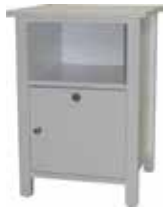
1 Drawer Bedside Cabinet 640h x 450w x 420d