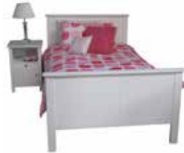
Apple Bed - Full End - 700h Single, King Single, Double Queen