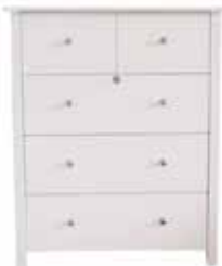
5 Drawer Tallboy 980h x 800w x 420d