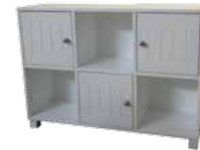
Cube Bookcase 1000h x 980w x 300d Other size options: 1. 2 cubes wide: 700h x 660w x 300d 2. 1000h x 660w x 300d