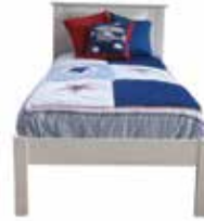
Apple Bed - Duvet End - 430h Single, King Single, Double, Queen