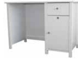
Dressing Table Desk 780h x 1100w x 520d