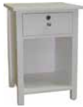
1 Door Bedside Cabinet 640H x 450w x 420d